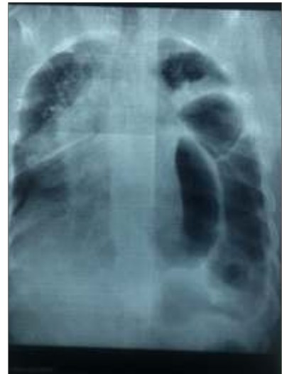
Figure 2 : X-Ray Chest PA showing bowel loops in left hemi-thorax with left lung collapse and mediastinal shift (11/03/2014)