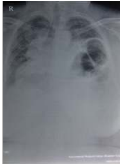
Figure 1 : X-Ray Chest PA showing bowel shadows in left hemi-thorax (10/03/2014)