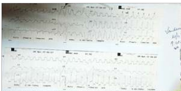
Ecg showing Acute Anterior Wall MI

Subsequently next day early morning, patient developed sudden onset chest pain with worsening of breathlessness and hypotension. ECG at that time revealed acute anterior wall ST segment elevation myocardial infarction (STEMI). Patient's condition worsened and she started rapidly desaturating. She was immediately intubated and put on ventilatory support. Dual antiplatelet agents with statins were given through Ryle's Tube. Cardiologist opinion was taken but she deteriorated so rapidly that no