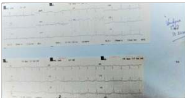
Ecg on Admission which Was normal Except