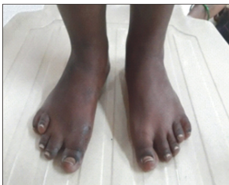
Figure 3 : Brachymetatarsia