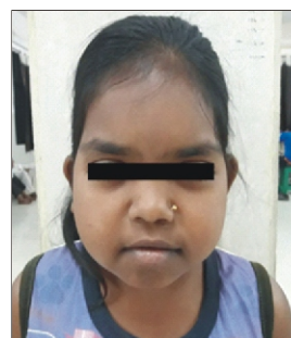
Figure 1 : Round Facies

On examination, she was obese, short statured (ht - 112 cm, wt - 40 kg, BMI - 32 kg/m 2 ). She had typical phenotypic features. Round facies, low set ears, depressed nasal bridge, brachydactyly and brachymetatarsia. ( Fig. 1,2,3 ) Examination of oral cavity showed dental caries, malocclusion of teeth impaired dentition. She also had classical "knuckle dimple dimple sign" ( Fig. 4 ) Her systemic examination revealed no significant abnormality except for pseudohypertrophy of calf muscles. She had delayed bone age of 11 years according to Greulich and Pyle chart. 2