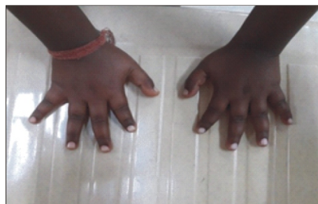
Figure 2 : Brachydactyly