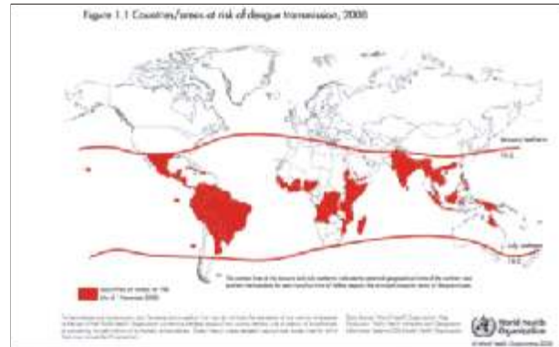
Fig. 1 : shows the countries where it already became clear the presence of infection in zero epidemiological surveys and indigenous transmission of the disease.

Clinical manifestations of infection caused by ZIKV, the information is limited to descriptions of isolated cases or series of cases in epidemic situations. The incubation period ranges from three to 12 days after the mosquito bite infected similarly to that described for other arboviroses 10 Clinical manifestations of the disease can vary depending on location, and often a syndrome 'type-dengue'. asymptomatic infections are also described from survey results serological. 11-12