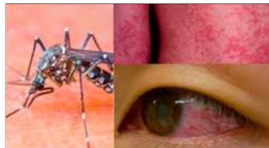
Fig. 2 : rash caused by infection Zika virus and conjunctivitis

McNamara 7 described the first three human cases of infection ZIKV in 1954 in Nigeria, associated with jaundice. However the location was endemic for malaria and FA and therefore it was not possible to differentiate between the manifestations of the disease ZIKV other diseases. Later, Bearcroft 35 induced infection in healthy volunteer through exposure to Ae. aegypti infected; the patient presented with a fever especially and self-limited without rash, three days after the inoculation. In fact, this seems not experimentally infected individuals have developed viremia sufficiently intense to allow transmission of the ZIKV Ae. Aegypti that about him fed.