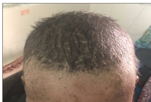
Figure 1 : Non Cicatricial Hair Loss

since childhood. Patient was conscious, well oriented to time, place and person. Patient was febrile, Pulse was 115/min, Respiratory Rate was 24/min, Blood pressure was 100/70 mmHg, Pallor was present. Hair loss was present. Nasal crustings were seen on anterior rhinoscopy and Legs showed multiple palpable purpura and ulcers. All the appendicular joints had features of arthritis. No icterus, clubbing, cyanosis. There was decreased air entry along with crepitations in the right infra mammary, infra scapular and infra axillary region. Abdomen was soft and non tender with no organomegaly. Heart sounds were normal with no adventitious sounds.