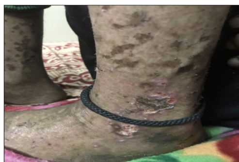
Figure 2 : Multiple palpable purpura and ulcers

1 Associate Professor, 2 Junior Resident, 3 Junior Resident Department of Medicine Government Medical College, Nagpur