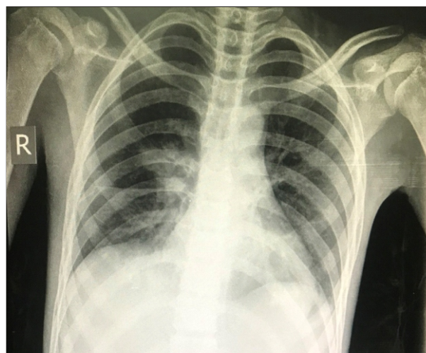
Figure 4 : Chest x-ray after treatment showing resolution of the cavity