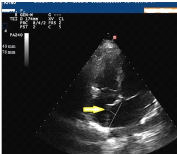
Figure 2 : Case 1- 2D Echo shows - An atrial septal aneurysm