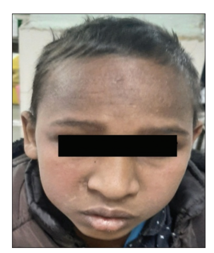
Figure 1: Scarring lesions over the face

A 15-year-old male presented with complaints of fever without chills and rigors, scarring lesion over face, back, and trunk, hair loss, and generalised weakness, since 10-12 months, and a decrease in appetite in the past 1 month. Patient had been receiving treatment outside for 3-4 months with no relief. He